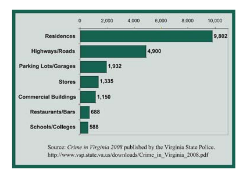
Figure 2. Virginia 2008 Violent Crime Locations