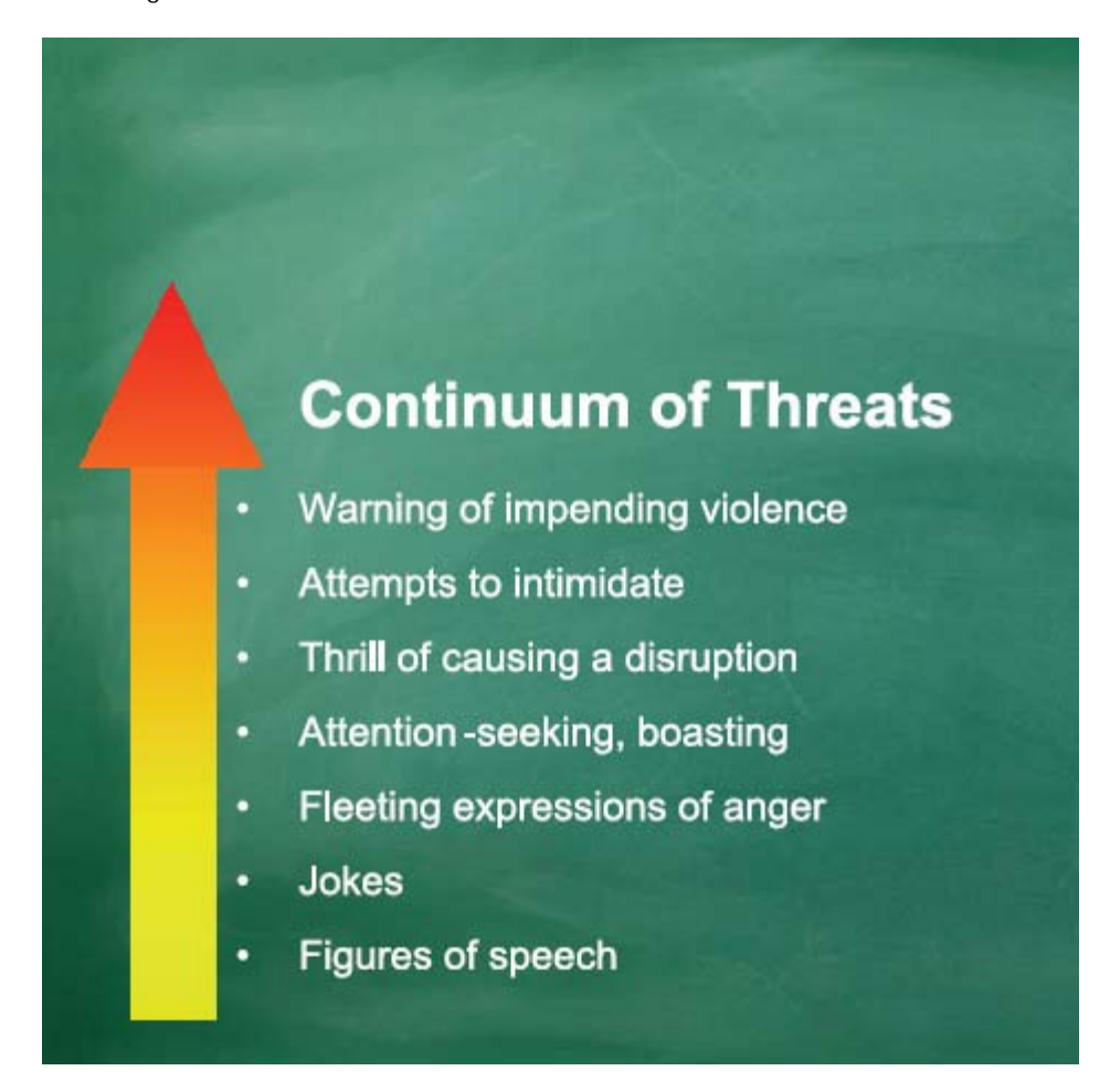
Figure 4. Continuum of Threats